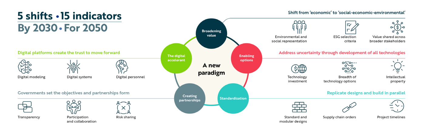
Figure 1. Five From Ambition to Reality shifts.

Paradigm shifts and resulting change can be made to feel safer and more possible by tracking and publicizing progress towards the identified goals and, in the process, demonstrating buy-in and cooperation from a broad set of stakeholders. To do so, Princeton University's Andlinger Center for Energy and the Environment in 2023 launched an annual panel survey that recruited a global set of stakeholders engaged with and/or impacted by the energy transition, the Princeton Net-Zero Stakeholder Survey.